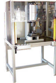
Vertical Assembly Press