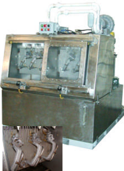
Water Crossover Wash Machine