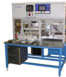
Supercharger Intake Leak/Flow Test Station

For over 20 years, our customers have entrusted us to help them develop, design, and build the turn-key solutions to the manufacturing challenges encountered.