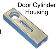
Door Cylinder Housing