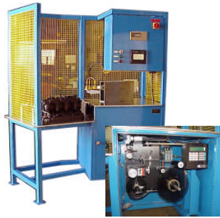
Inspection & Label Applicator