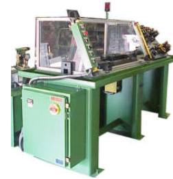
Horizontal Bearing Press